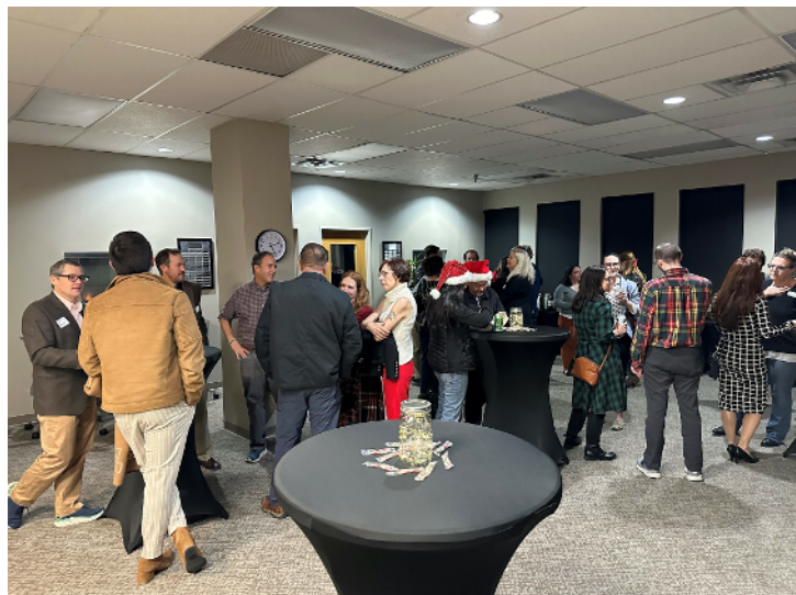
BCBA Holiday Party