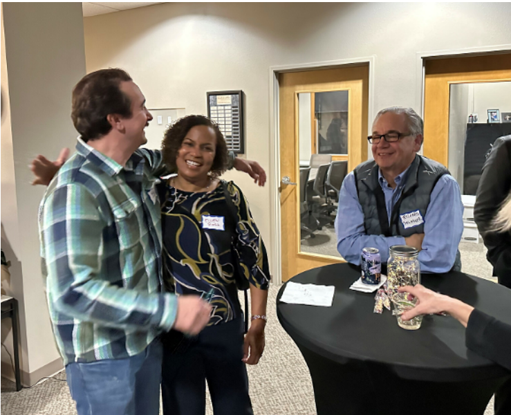
BCBA Holiday Party