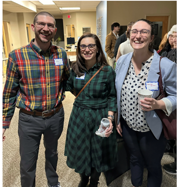
BCBA Holiday Party