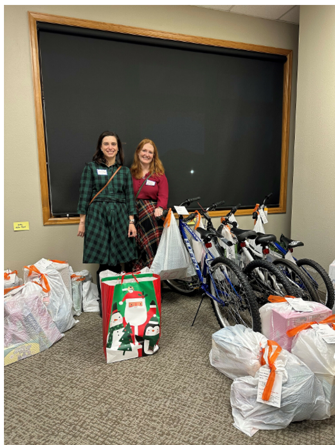
Thanks again to all who participated in our holiday gift drive!