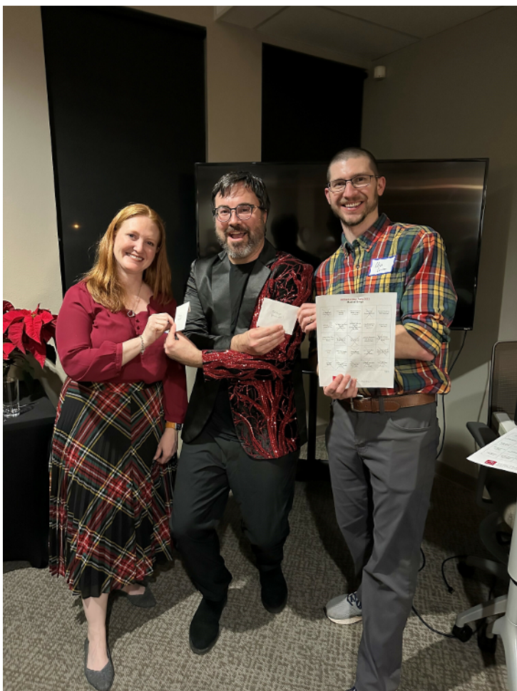
Our Musical Bingo winners