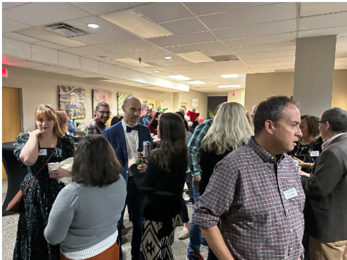
BCBA Holiday Party